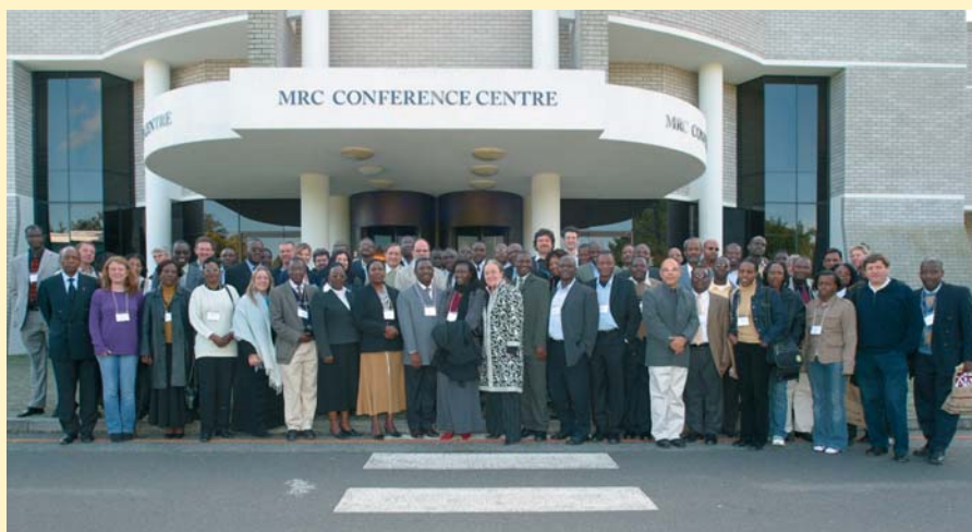
Participants at the 2006 EDCTP investigators' meeting, South Africa

European Commission and National Regulatory Officials from Zambia), 11 members of EDCTP Developing Countries Coordination Committee, a member of the European Network of National Programmes, 3 members of the EDCTP Partnership Board and 8 members of the EDCTP secretariat. At this meeting participants shared experiences and exchanged information on existing projects, facilitated the establishment of South-South links (e.g. mentorship programmes, nodes of excellence, and sharing of facilities and expertise), explored common grounds of interest such as possibilities of joint grant applications, proposed a direction of research agenda to EDCTP as determined by the experiences from the ongoing projects, discussed regulatory issues, discussed the use of the established EDCTP clinical trial registry, and role of African institutions in clinical trials sponsorship.