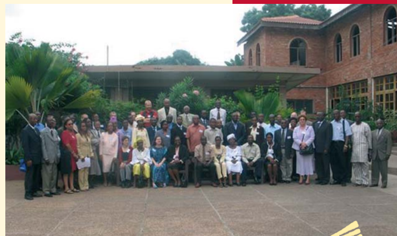
Participants at the first Afro Vaccine Regulators' Forum in Accra, Ghana

The forum also looked into identifying additional training needs to be facilitated by WHO including: